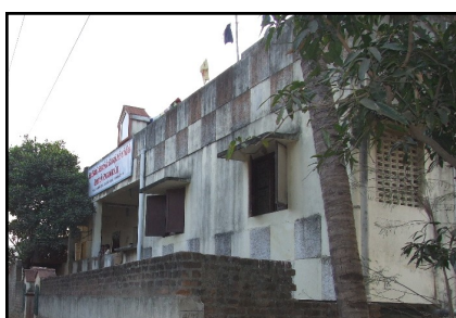
St. Joseph Centre – 2006

Improvements to the Building: When I first visited in 2006 I was taken aback at the conditions the children were living in. The building was very dark and basic. All the children slept together on mats on a concrete floor in the main hall. The bathrooms and kitchens were in a poor state and in general it was a cheerless environment for the children. Now as soon as you enter the main gate the new changes can be seen. A dusty bare earth area inside the