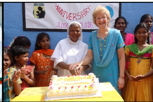
Cutting the 10th Anniversary cake – 2016