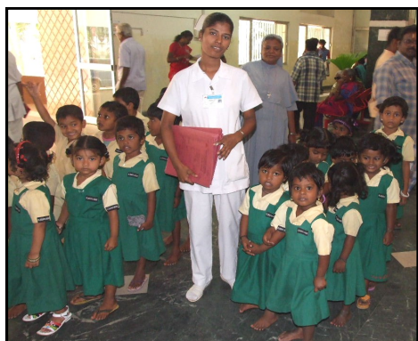
Hospital visits – 2006

Medical Care and Health Awareness Programme: Over the years steps have been taken to improve the medical care for all the children. Mainly due to poor diet and mosquito borne diseases the children suffer many health problems. In the early years we had to transport the children to a local hospital in batches of 30. This was time consuming, costly and a logistical nightmare. Through ‘Punch Charity’ we have now set in place regular visits from volunteer doctors to the St. Joseph Centre to monitor the children’s health. As well as giving advice on health care and proper washing routines, medical records are kept to ensure that recurrent problems are followed up. Any medication recommended