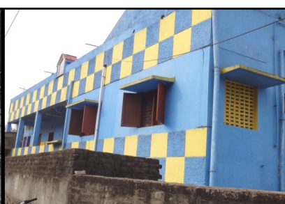
St. Joseph Centre – 2016

main gate of the Centre has been transformed into a welcoming entrance concreted over and decorated with beautiful bright painted flowers. This now provides an ideal playground for the children. A coat of lovely bright blue and yellow paint has greatly enhanced the look of the dreary grey exterior of the building. The concrete floor in the main hall has been completely tiled and the walls are painted in fresh coral.