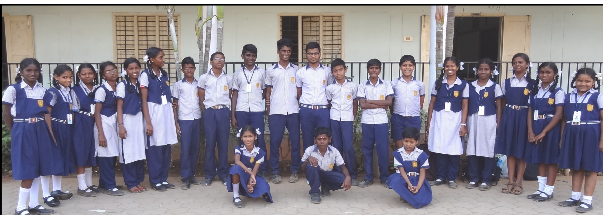
26 Children sponsored at English medium schools – 2016