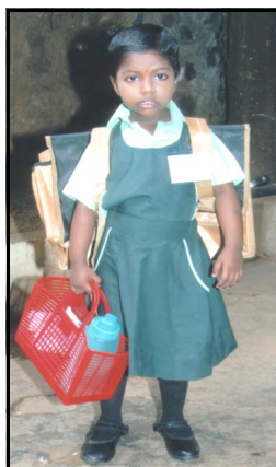
One child - 2006