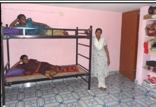
Spacious new bedrooms – 2016

Five new bedrooms, toilets and washrooms have been built on the upper floor for the girls giving them their own private space. The boys now have their own sleeping area and washing facilities on the ground floor. This means that the St. Joseph Centre now complies with the new government regulations