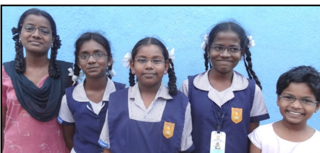
Regular eye screening - 2016.