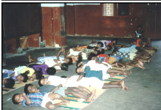
Sleeping conditions – 2006.